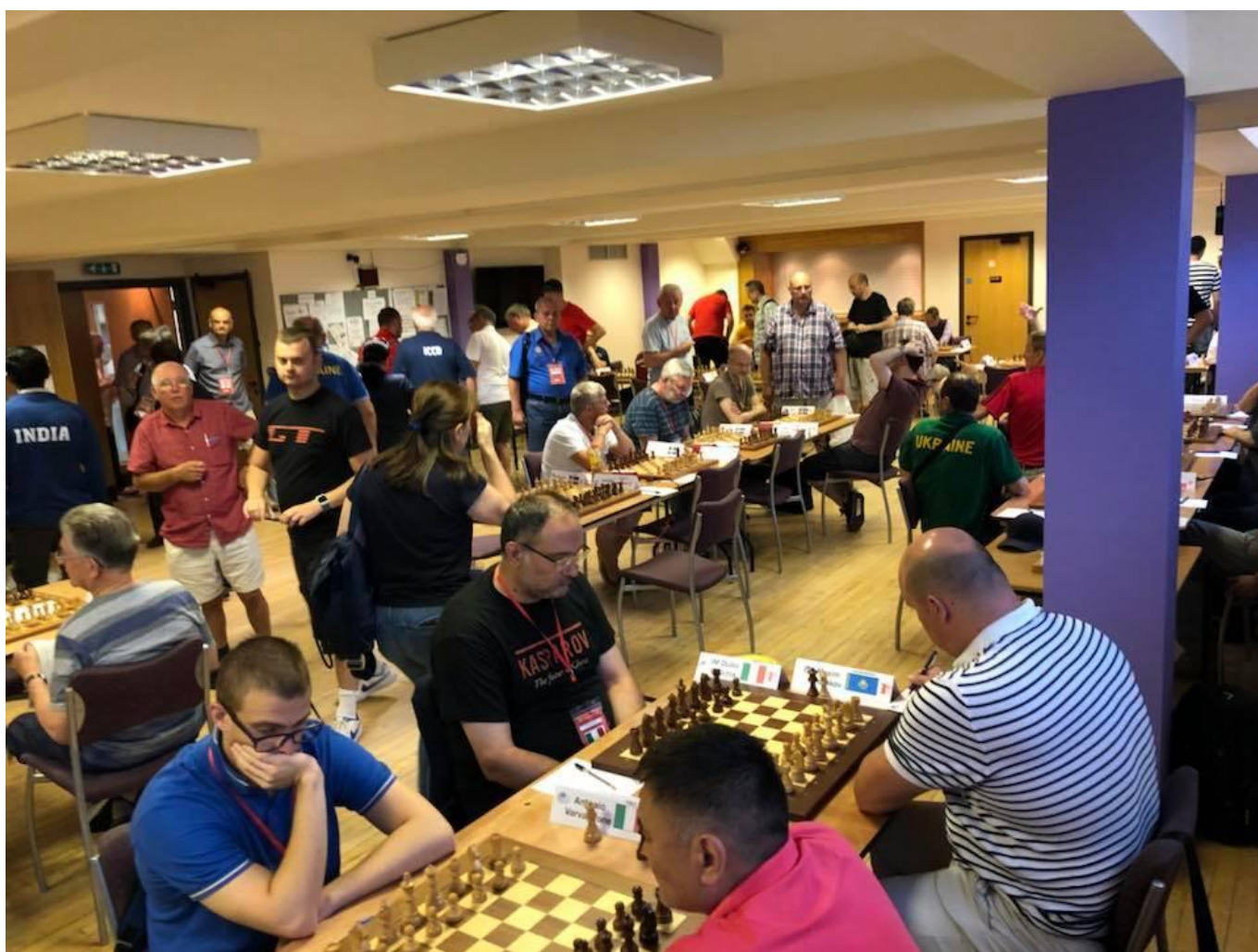
Durante le gare