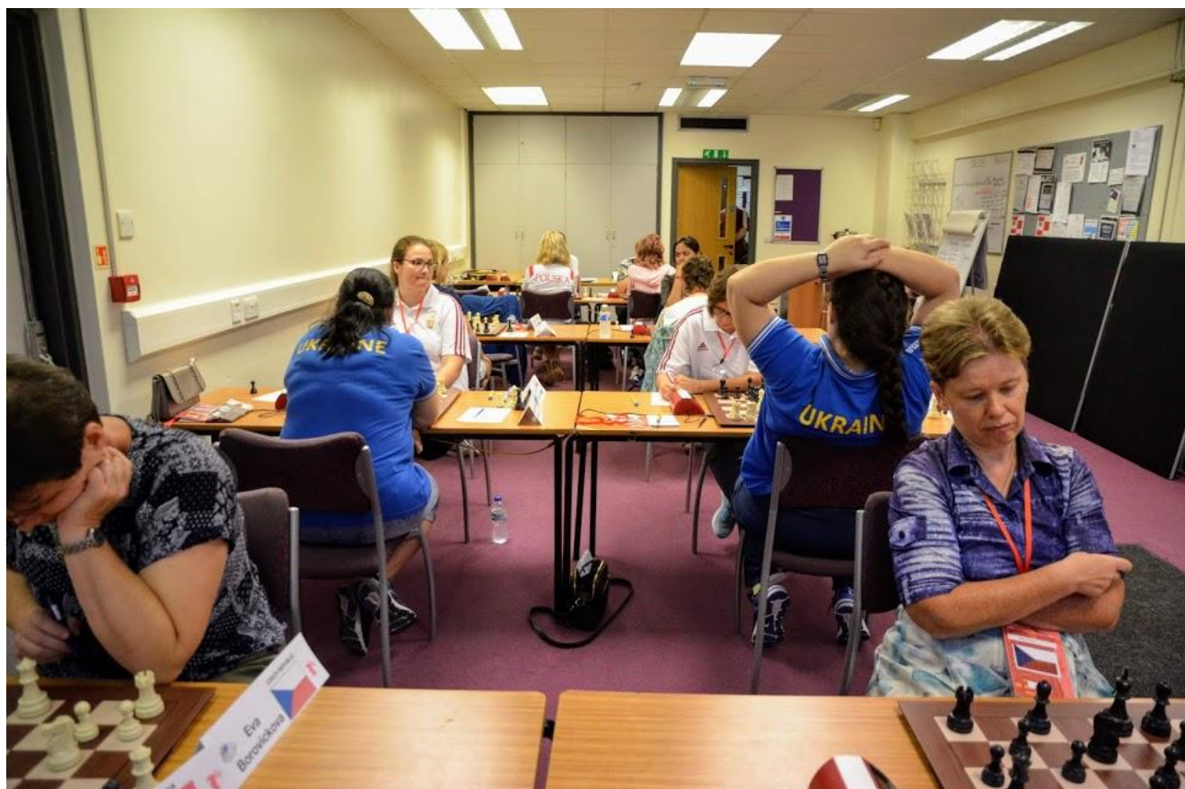
Durante le gare femminili