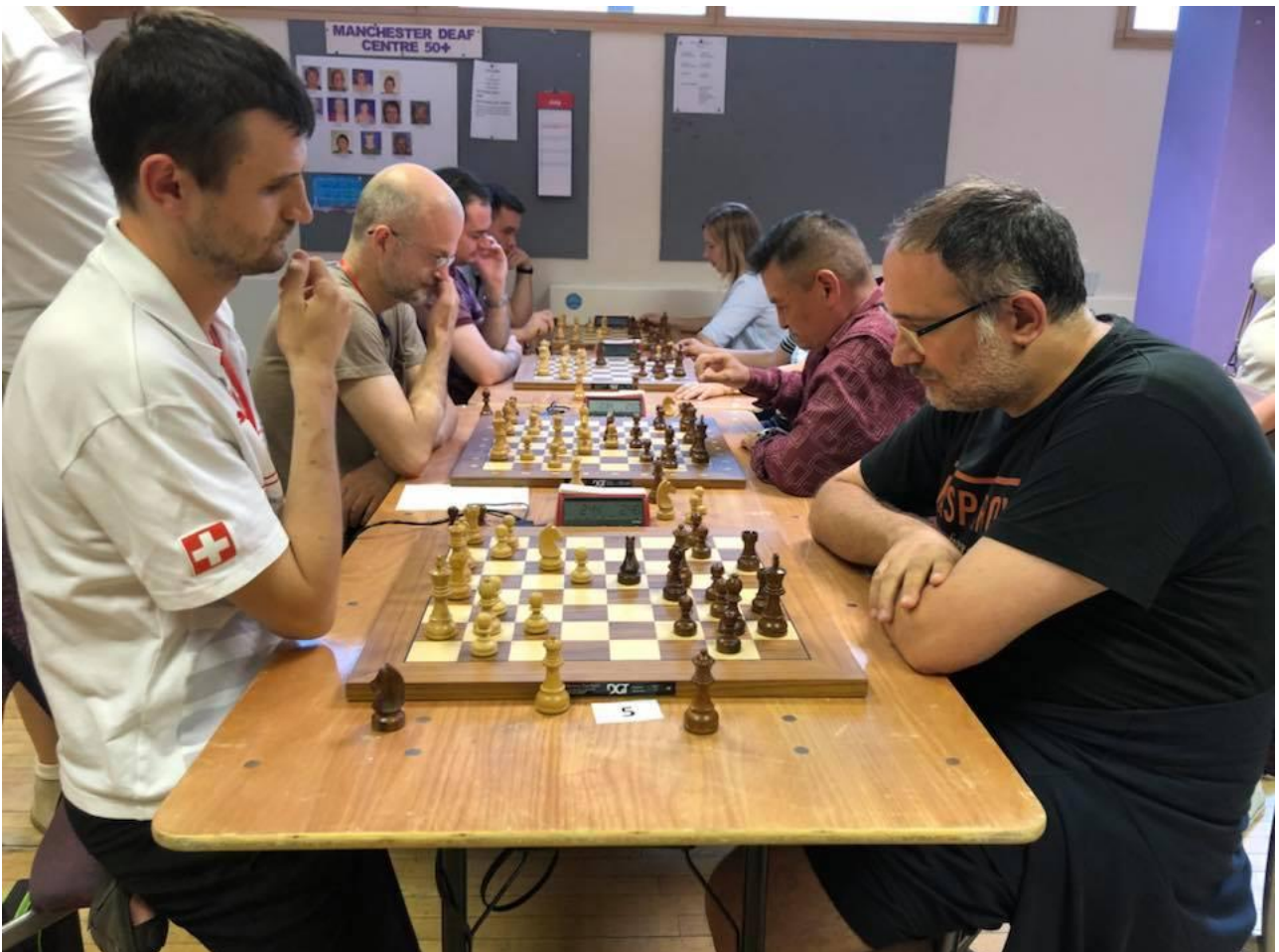
Durante le gare di lampo